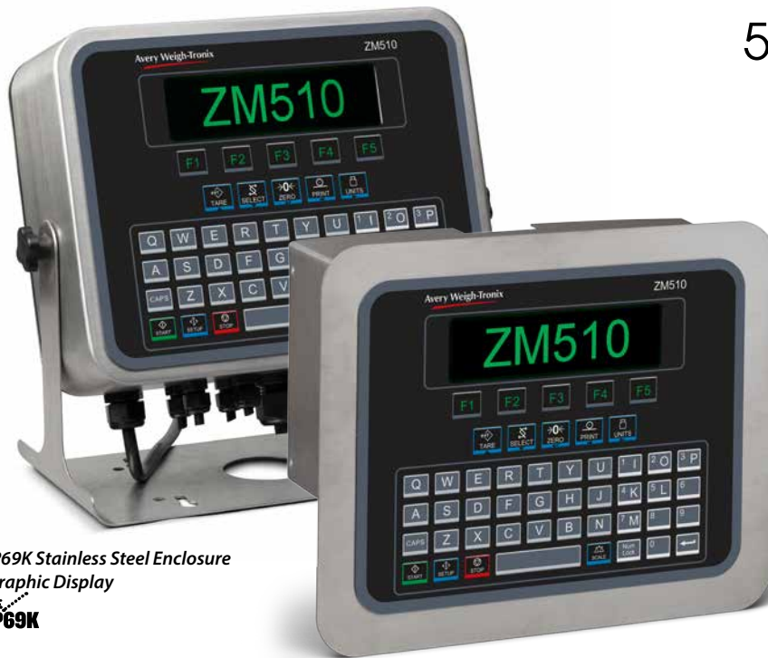
IP69K Stainless Steel Enclosure Graphic Display IP69K